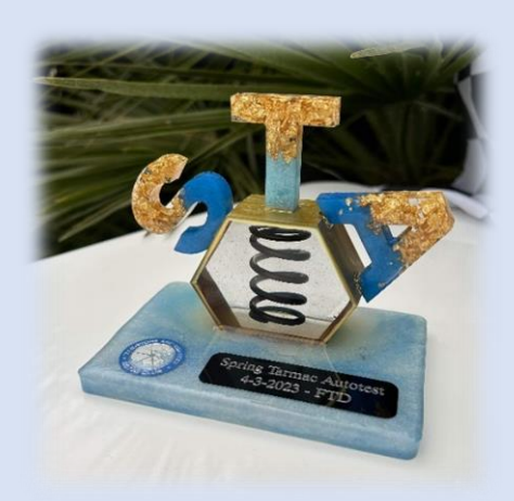
The 'Spring Tarmac Autotest' Unique FTD trophy