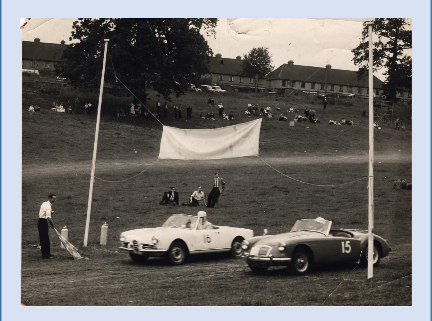
Autocross held in Mote Park Maidstone